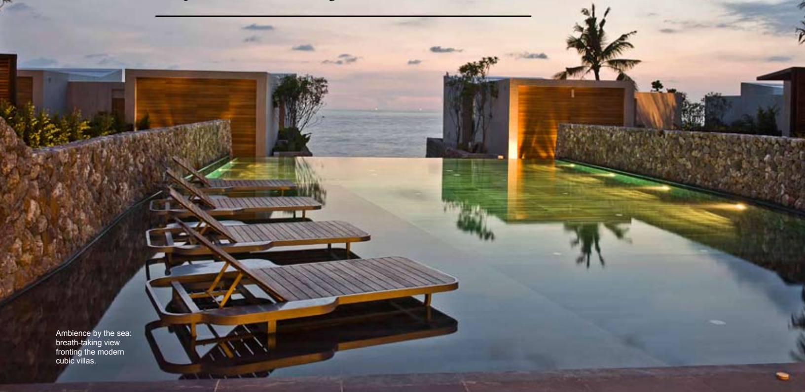
Ambience by the sea: breath-taking view fronting the modern cubic villas.

Escape to the next best thing to heaven.