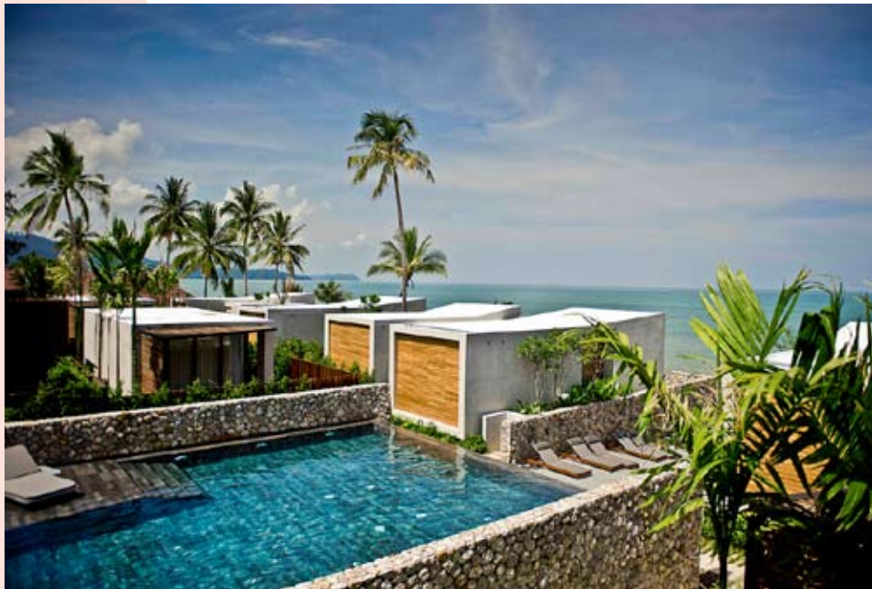
Casa de la Flora on the beautiful unspoilt beach of Khao Lak.

Strolling along the unspoilt coastline of Khao Lak, Thailand, be surprised by a striking complex of buildings situated on the beach.