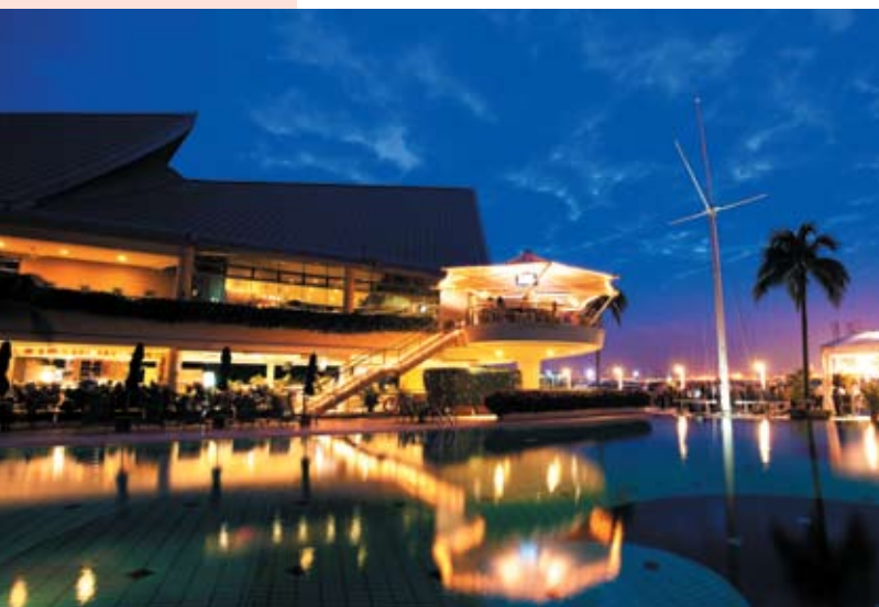
Top: Let your yachting dreams set to sea at RSYC ... sails ahoy!