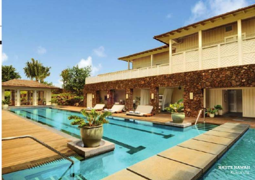
HAUTE HAWAII Kukui'ula.