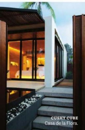
CUSHY CUBE Casa de la Flora.

A surprising sight along the unspoiled coastline of Khao Lak, Thailand, is the just-completed complex of buildings that make up Casa de la Flora hotel. The hotel comprises 36 contemporary gray cube villas, which are tiered back from the coastline and set in lush vegetation. For dining, La Aranya restaurant, just steps from the beach, lures guests with Thai and international cuisine. The property also employs a range of eco-friendly initiatives, including chemical-free pools, water recycling, and use of recycled paper and aluminum furniture. Casa de La Flora is located directly on the beautiful beach of Khao Lak and close to Khao Lak National Park. The hotel is a one-hour drive from Phuket International Airport. Rates start at $370. designhotels.com/casadelaflorea .